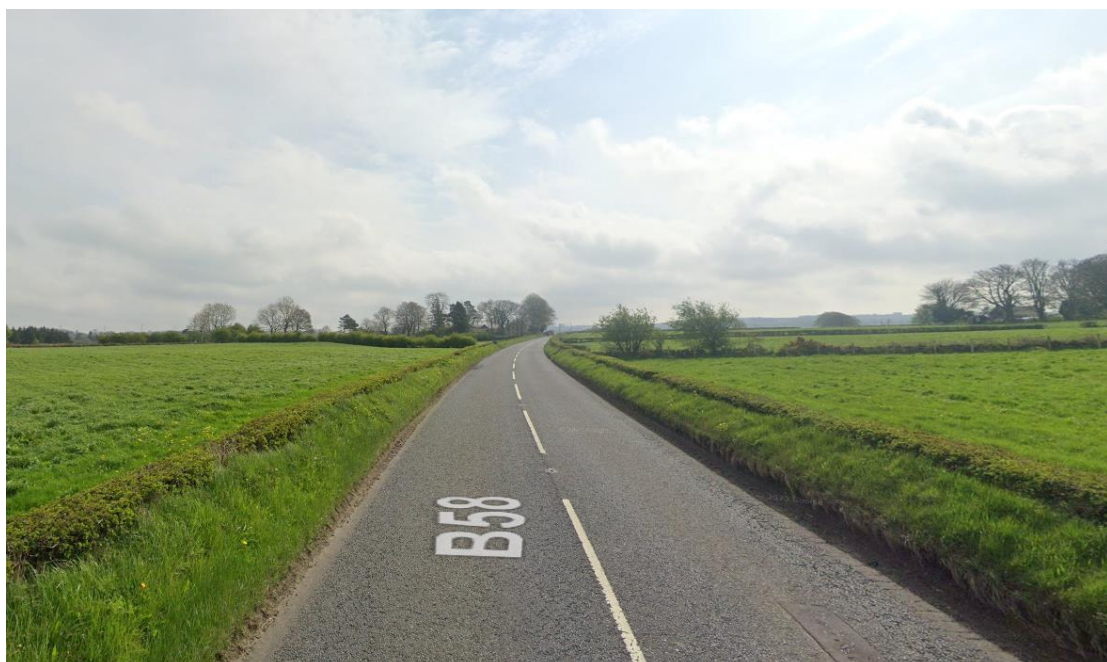
Figure 3: B58

The infrastructure along this section of route has been assessed as suitable for construction deliveries without any major alterations anticipated.