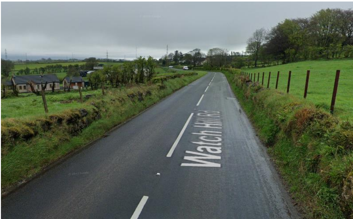
Figure 4: Watch Hill Road

The infrastructure along this section of route has been assessed as suitable for construction deliveries without any major alterations anticipated.