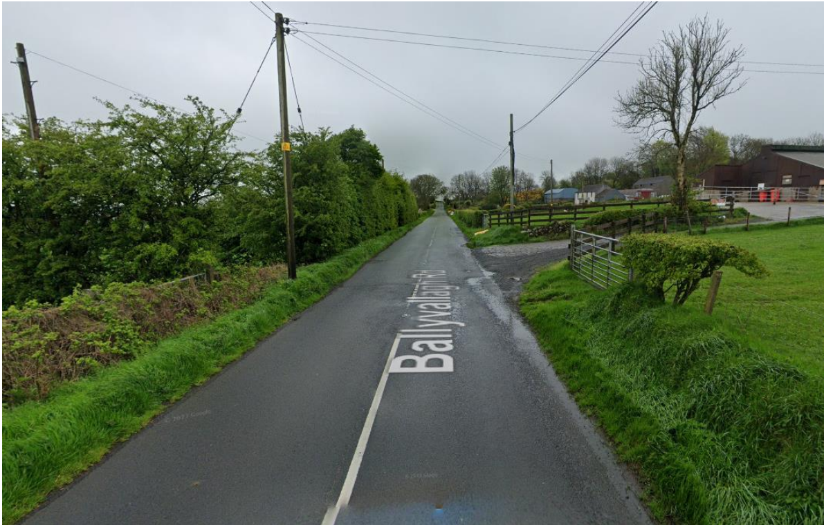
Figure 5: Ballyvallagh Road at proposed site entrance