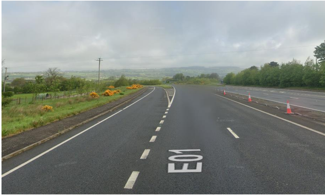
Figure 2: Exiting A8 onto B58